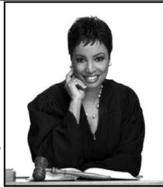
Divorce Court's Judge Lynn Toler returns to talk to Valder about the hot divorce topics of the day

FOLLOW US ON TWITTER.COM/VALDERBEEBESHOW